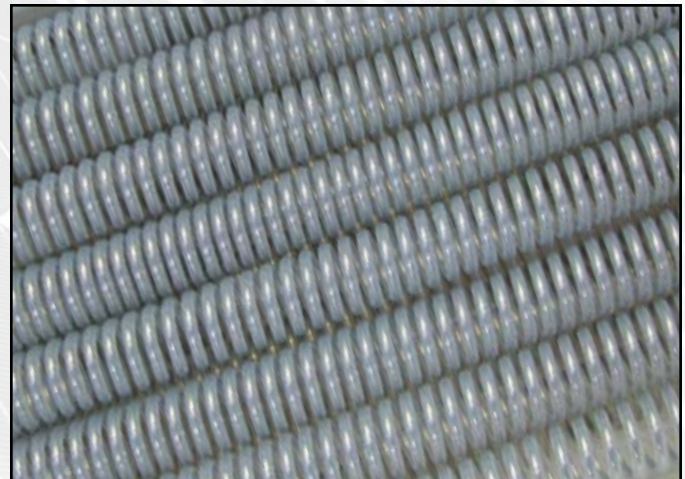
High Purity PFA Jacketed Elements for No Metal Contact