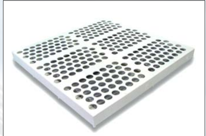
Heateflex® Immersion Frame Heater

BENEFITS: Produce a higher quality product without raising production costs.